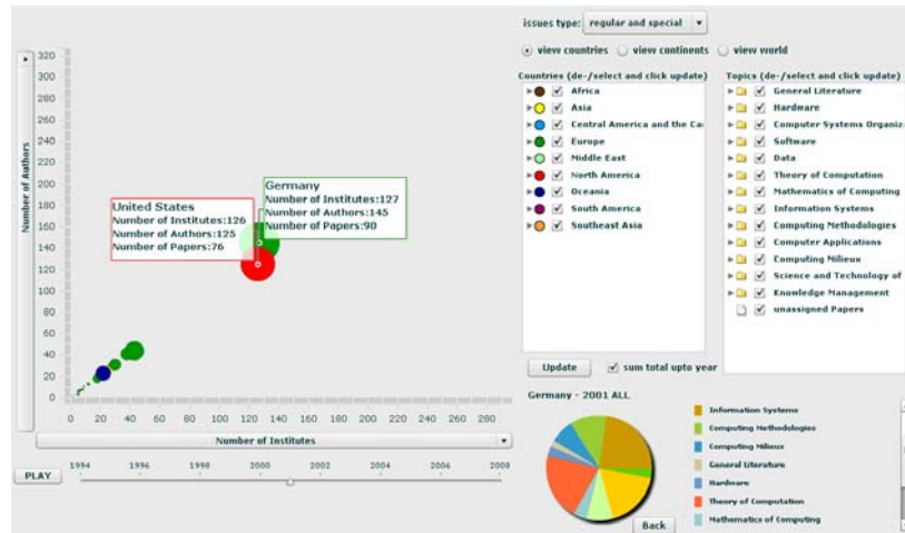
Figure 1: Main Interface.