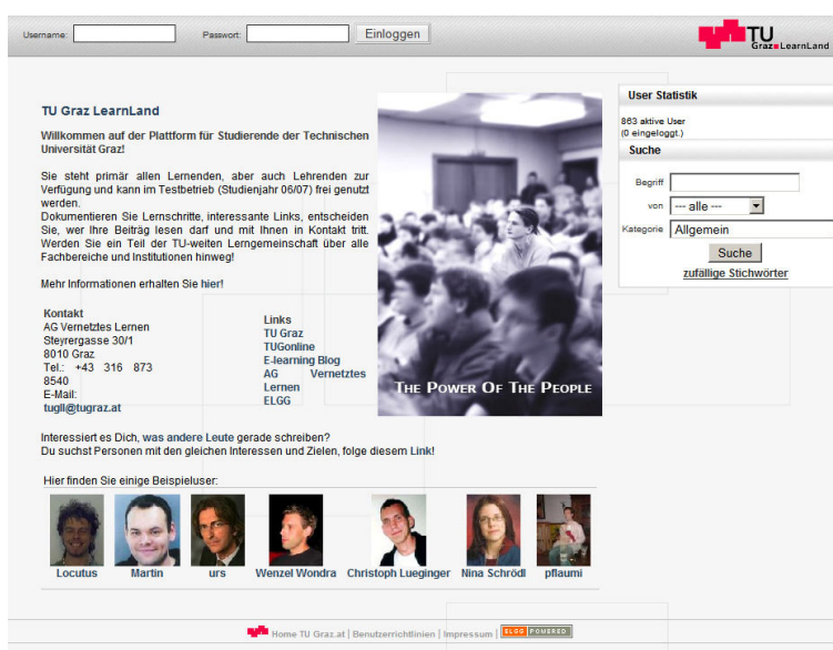
fig. 1 TU Graz LearnLand ( https://tugll.tugraz.at )

From a very technological view weblogs are only “frequently updated websites consisting of data entries arranged in reverse chronological order” (Walker, 2003) (Schmidt et al., 2005). At the first sight weblogs seem to be very simple tools. But they are maybe the first version of a very special possibility to contribute to the WorldWideWeb by anyone, to become an active part of the internet (Farmer & Bartlett-Bragg, 2005). The concept of decentralization (Kolbitsch, 2006), per-user publication (Karger, 2005) and user centered content is much more powerful as expected in the beginning. By using the RSS (Really Simple Syndication) technology not only monitoring of a number of other weblogs is possible, but also to personalize information.